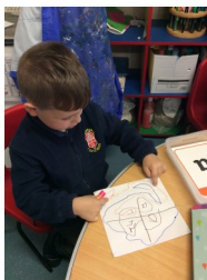
Christian's treasure map