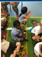
We learnt about odd and even

We went to look at the year 1 classroom.