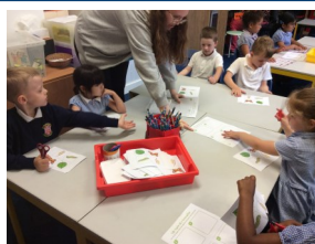
Our group work about caterpillars