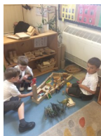
The boys made a castle