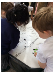
We drew roads for the cars