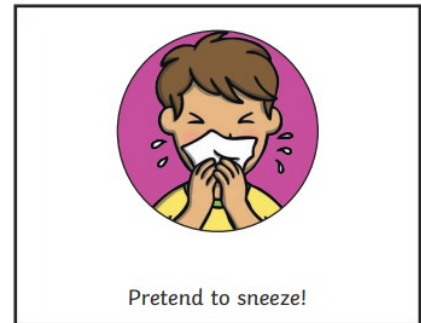
Pretend to sneeze!