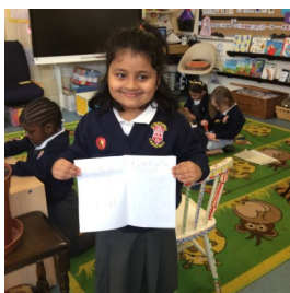
Olivia's Pond Book