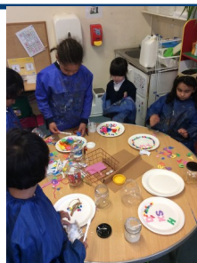
Our busy creative table