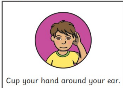
Cup your hand around your ear.