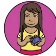
Pretend to open a purse.