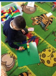
Luca's dinosaur jungle