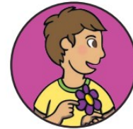
Pretend to squeeze the squirty flower on your coat.