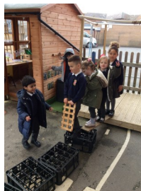
3 Billy Goats Gruff!