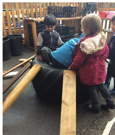
The children made a rocket.