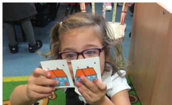
Juno found the matching houses.