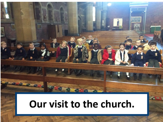
Our visit to the church.