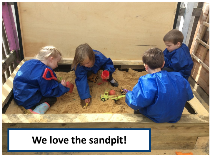
We love the sandpit!

We would love to see or hear about the learning your child has been doing at home. The children love to share with their friends what they have been doing. Please email acorn@st-barnabas.kent.sch.uk any photos or comments about what your child has been doing!