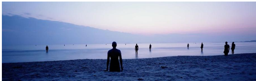
Antony Gormley's sculptures