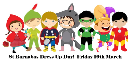
St Barnabas Dress Up Day! Friday 19th March

To celebrate Red Nose Day, World Book Day and Story Telling and Shakespeare Week, we are going to have a dress up day. On Friday 19 th March, all children are invited to come to school dressed up in one of the following ways: