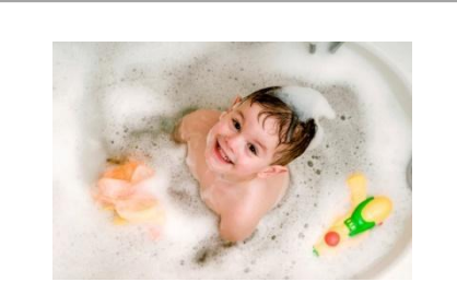
Having a bath