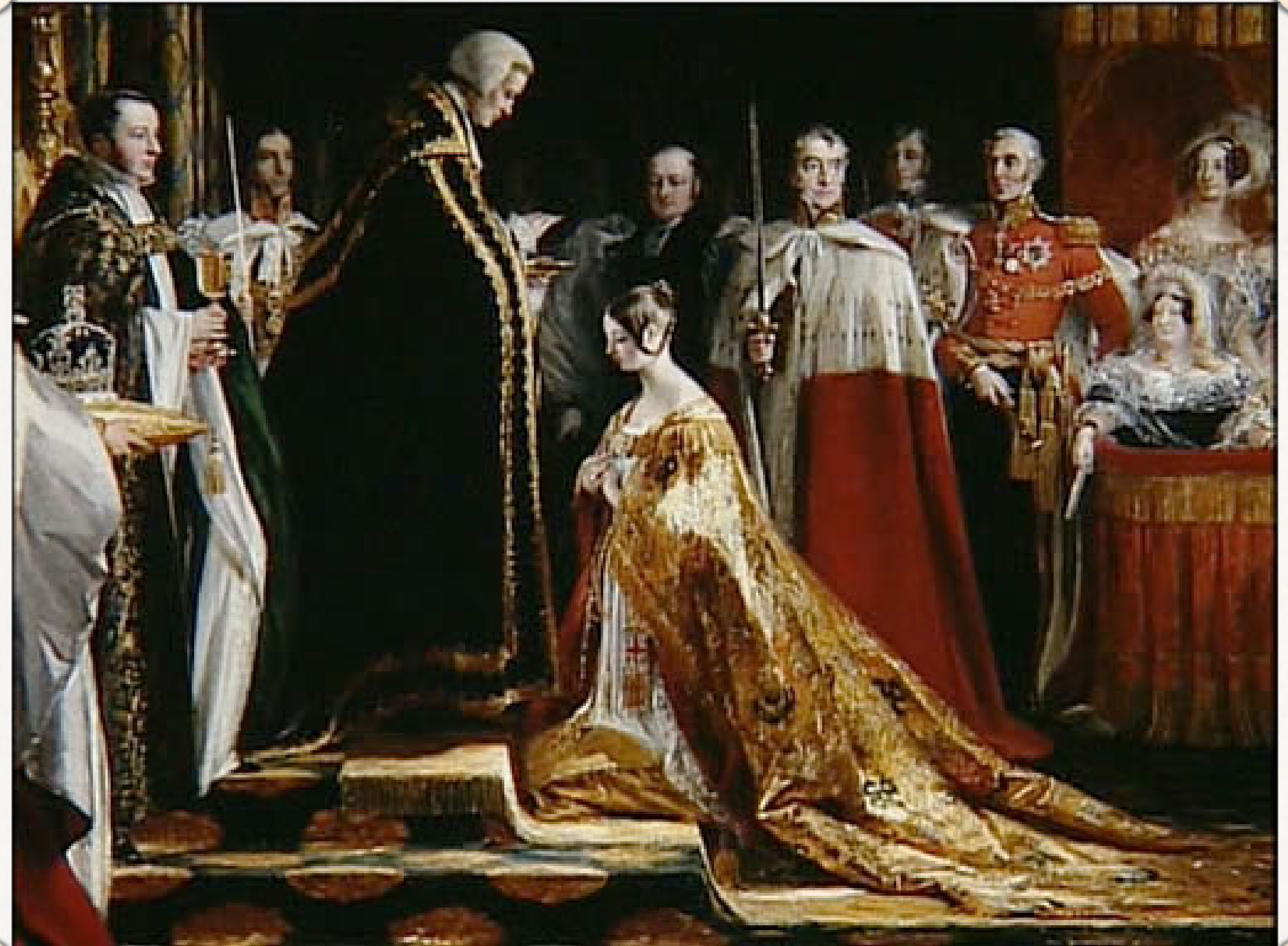
The coronation of Queen Victoria

When Victoria first became queen some people thought she would be too young to rule effectively and that other powerful people would be able to influence her. However, Queen Victoria had a strong sense of what was right and what was wrong and could be stubborn when she needed to be. Most people in Britain were delighted that someone young and energetic was coming to the throne as the old kings that had come before her had been very unpopular.