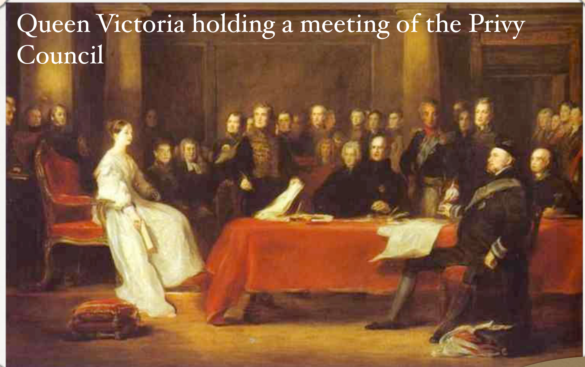
Queen Victoria holding a meeting of the Privy Council

Queen Victoria took her duties very seriously and made a promise at the start of her reign that she would always do her best for her country.