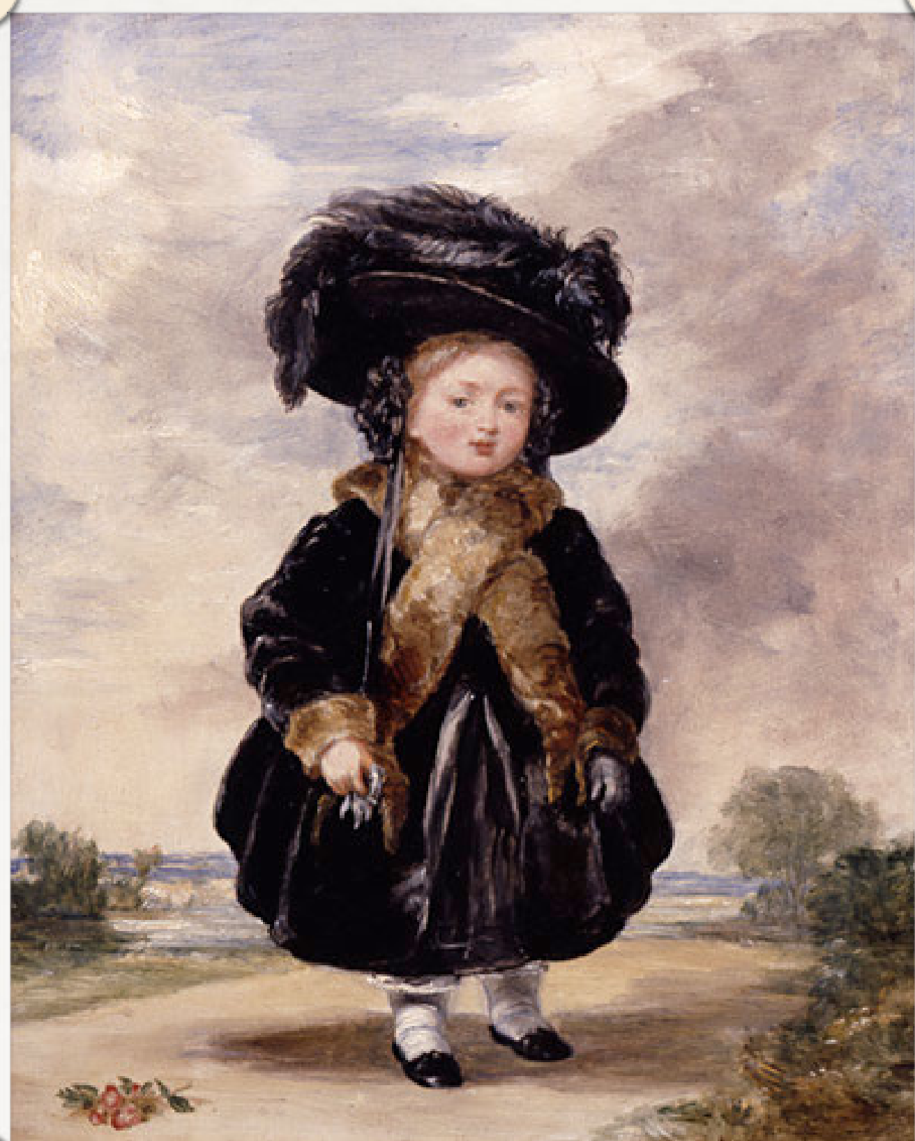
Princess Victoria, aged 4

Victoria was born in Kensington Palace in London on 24th May 1819. She was the daughter of Edward, Duke of Kent and Victoria of Saxe-Coburg. Her father was the son of King George III and brother to King George IV and William IV. At first, no one thought Victoria would ever be queen but her father's older siblings had no surviving children and she became next in line to the throne. Victoria's father died when she was still a baby and her mother gave her a strict and lonely upbringing. She rarely had friends to play with and spent a lot of time on her own drawing, painting or playing with her toys. The young princess had no brothers or sisters.