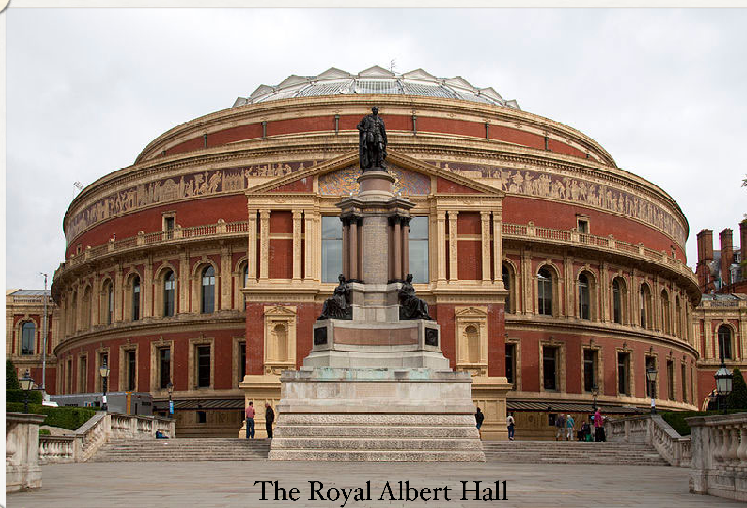
The Royal Albert Hall

Eventually, Queen Victoria's grief over the death of her husband lessened and she was able to fulfil her duties as queen again. She created several memorials to her husband, such as the Royal Albert Hall and the Victoria and Albert museum.