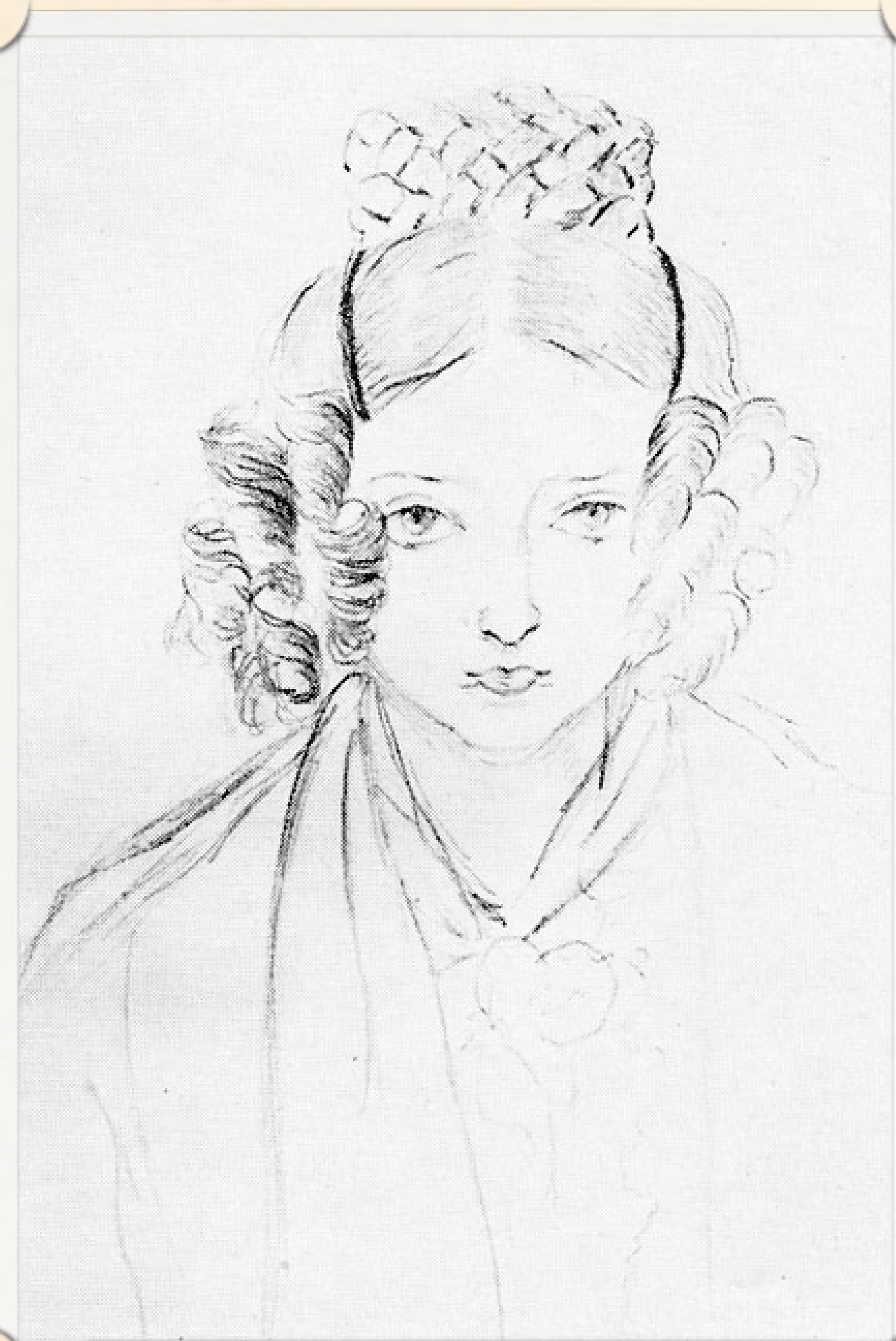
A self-portrait of Princess Victoria, 1835

As Princess Victoria got older, it became clear that she would one day be queen. Her mother prepared her for this by giving her a good education and making sure that she was aware of what her role as queen would entail. She could speak several different languages and was also a talented artist. At the age of 13, her mother took her on a journey around England to see how ordinary people lived. This helped her to understand what England was really like. It was at this time when Victoria first started writing a journal, a habit she continued every day until her death.